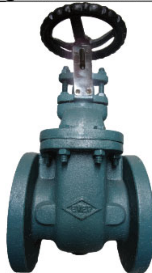
Fig PH600E Gate Valve

The Ever Fig. PH600E non-rising stem gate valves are mostly used for water application but are also suitable for general use on many other fluids. They have a solid wedge with matching tapered seats. Valves are fitted as standard with position indicator. Flanges available in AS2129 Table 'E', ANSI-125 and Undrilled.